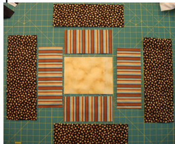
Front side fabrics (using three different fabrics)